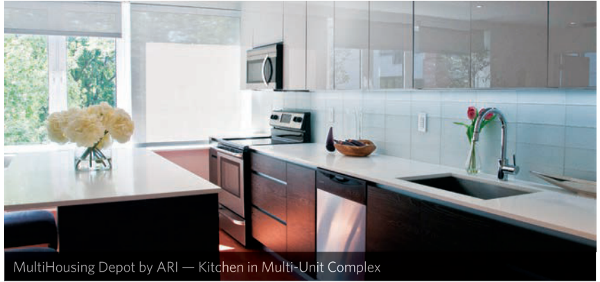
MultiHousing Depot by ARI — Kitchen in Multi-Unit Complex

Made in North America using only the highest quality materials, latest technologies and advanced manufacturing processes, every piece produced by Premier EuroCase is guaranteed to leave an impression.