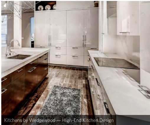
Kitchens by Wedgewood — High-End Kitchen Design