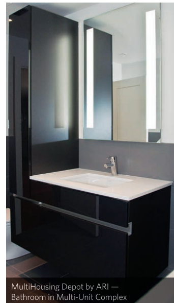
MultiHousing Depot by ARI — Bathroom in Multi-Unit Complex