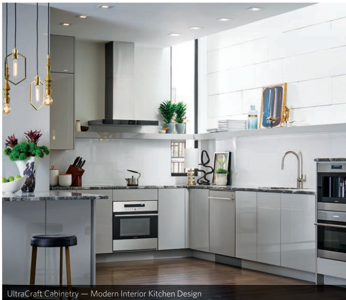
UltraCraft Cabinetry — Modern Interior Kitchen Design