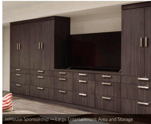
mHouse Sponsorship — Large Entertainment Area and Storage