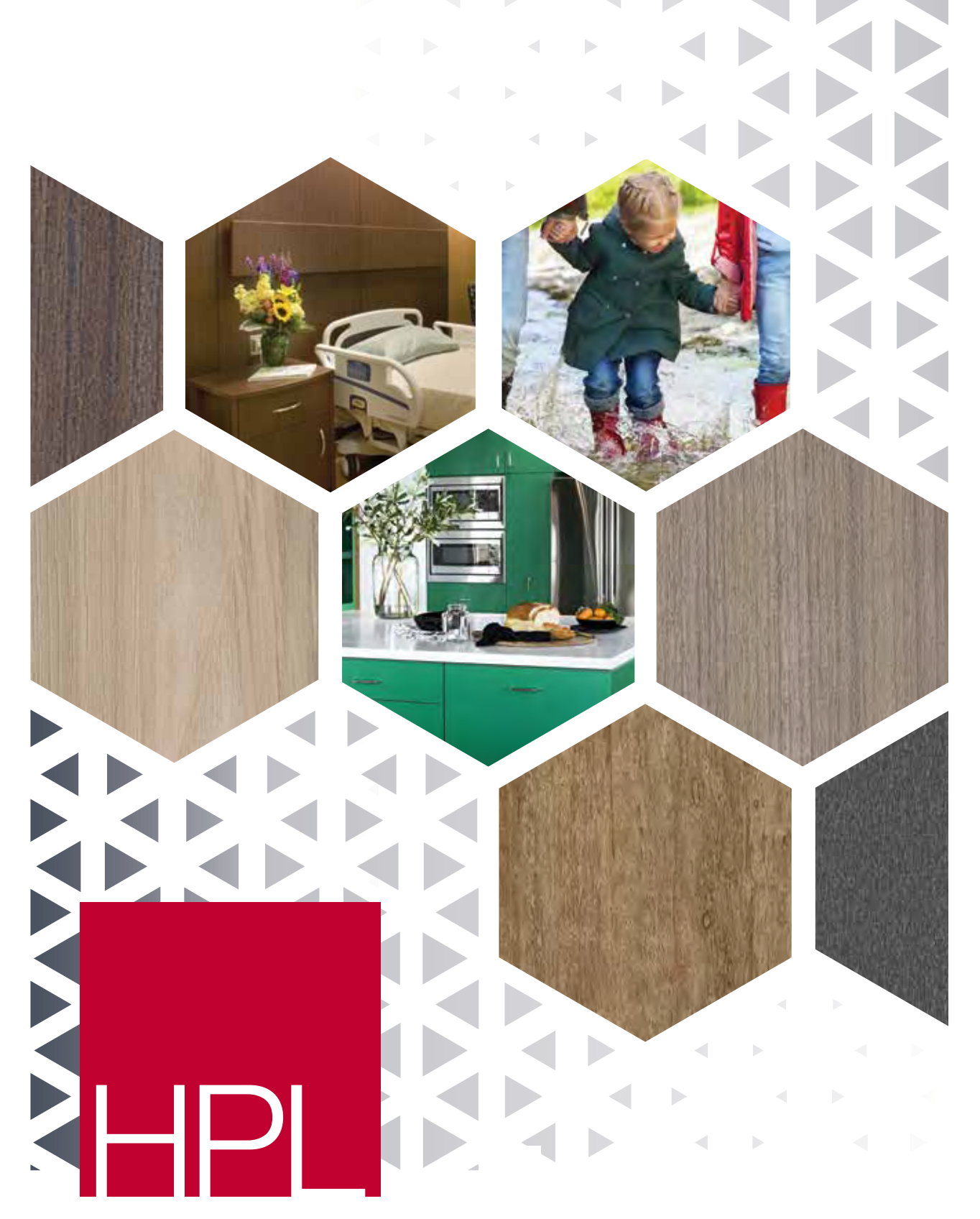
High Pressure Laminates