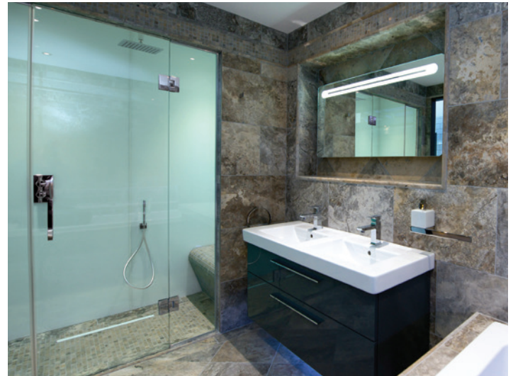
Bathroom and Shower Panels

Combining its beautiful ripple free, highly scratch resistant surface with magnificent panel depth and light weight, Lustrolite® is a vastly superior alternative to tiles, glass and other decorative panels.