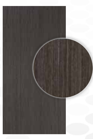
Slate BA – 03S