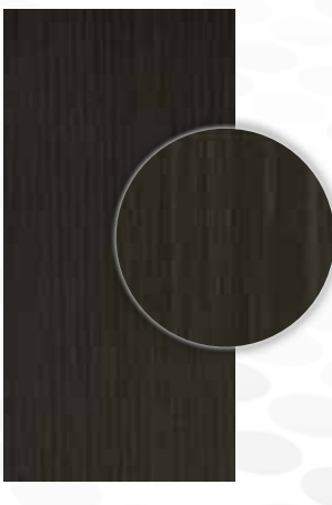
Qtr Gun Metal Ebony WT – 2450S