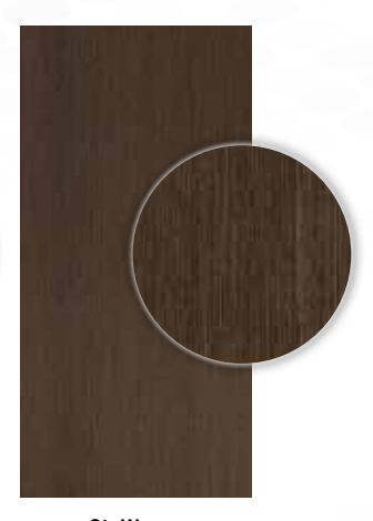
Qtr Wenge WG – 111Q