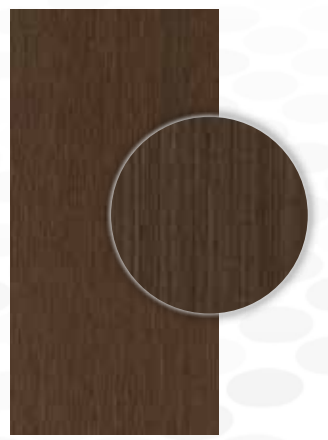
Qtr African Wenge TD - 5843S