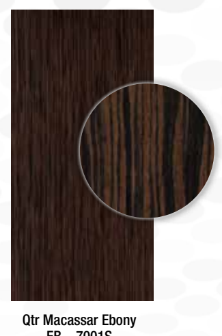
Qtr Macassar Ebony EB – 7001S