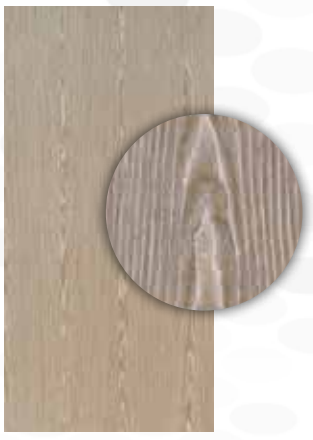
Napa W.0ak – 801C