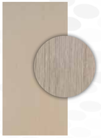
Monterey W.Oak – 09S