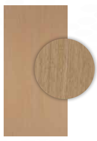
Rift White Oak Oak –12-1S