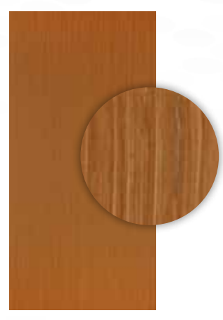
Qtr Cherry CH – 311S