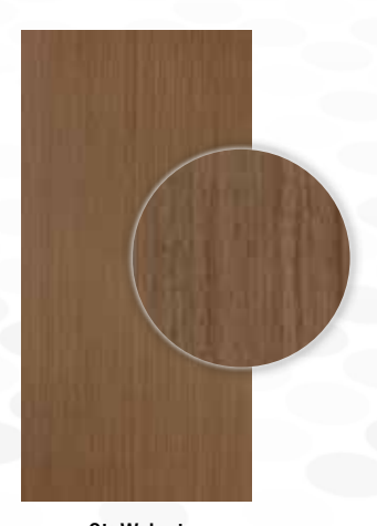
Qtr Walnut WT – 139S