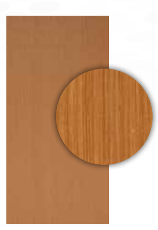
VG Fir Fir – 3Q