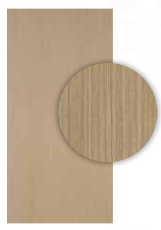
Qtr Champagne Champ – 2Q