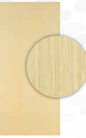
Qtr Maple MP -168S