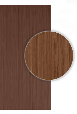
Qtr Teak TK – 016S