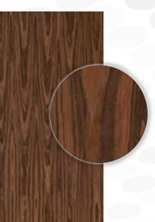
PS Rosewood RW - 3350C