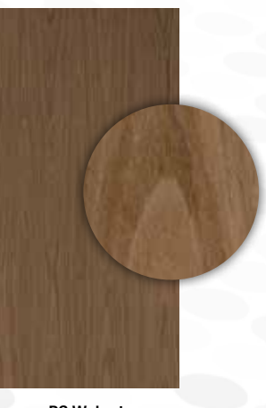
PS Walnut WT - 3160C