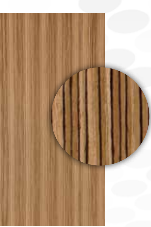
Qtr Zebrano ZB – 011S