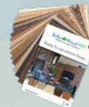
Fan & Prefinished Sets