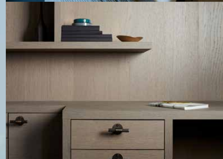
16 Colors Stocked by Rugby