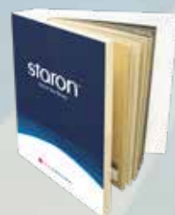
Sample Binder Available