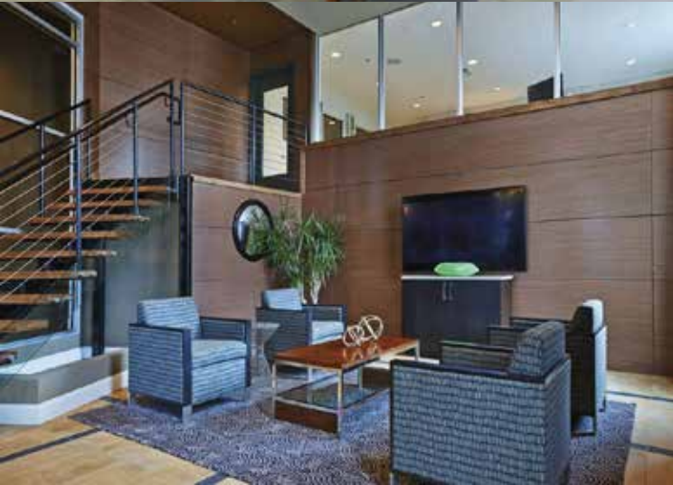
4 of the 16 Colors Stocked by Rugby