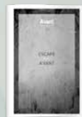
VT GeoScapes Brochure