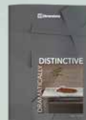
VT Dimensions Brochure