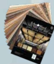
Fan & Prefinished Sets