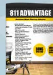
Wood Adhesive Brochure