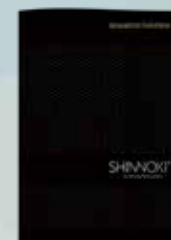
Shinnoki Acoustics Brochure