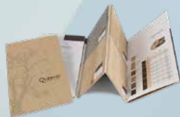
Sample Binder Available