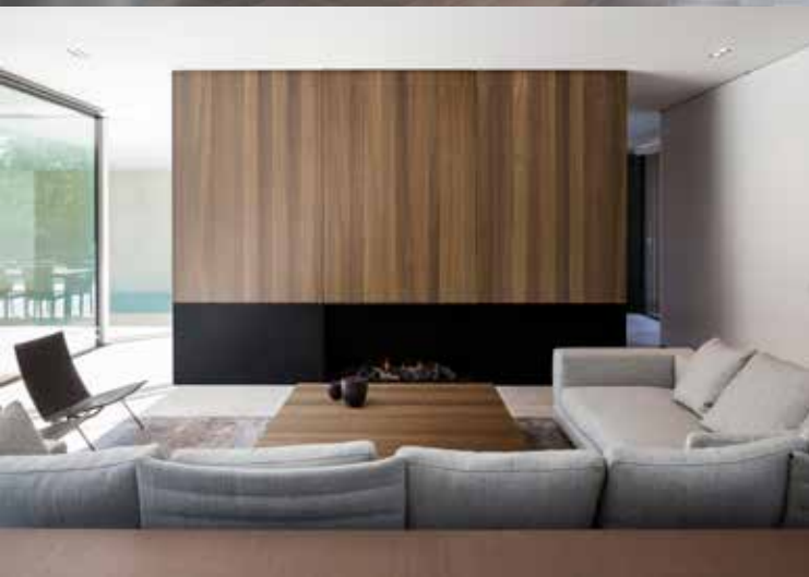
4 of 14 Colors Stocked by Rugby