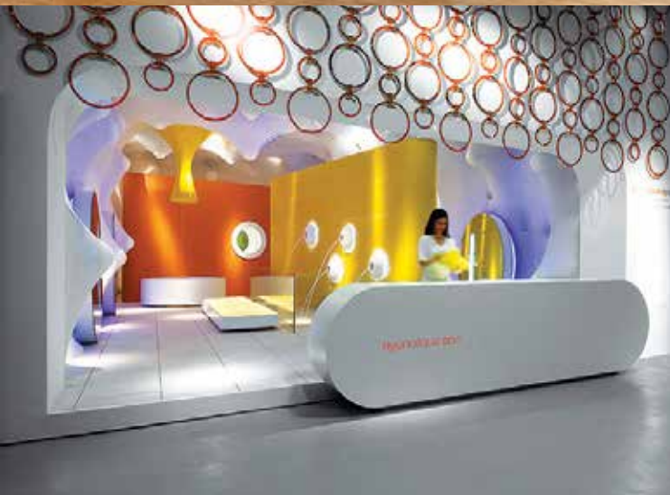
4 of 90 Colors Stocked by Rugby