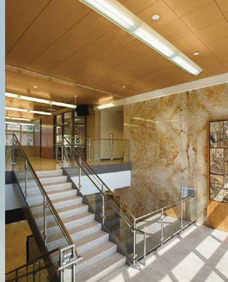
4 of the 16 Colors Stocked by Rugby